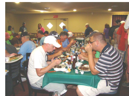
LUNCH at the Turn DINNER at the end of the Scramble