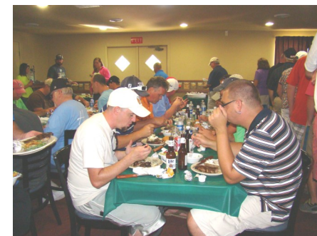
LUNCH at the Turn STEAK DINNER at the end of the Scramble